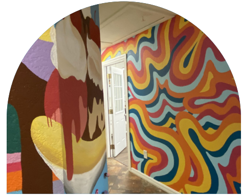
Mural at Entirety K—12 created through AIE Grant

In the 2022—2023 school year, the Arts Council awarded 6 grants totaling $2,269.82 and HCEF matched $1,740.08 for a total of $4,010 to support Hernando County art teachers in the following schools: